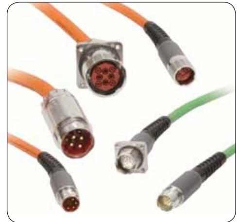
Cables are available for MP-Series Motors and other Allen-Bradley motors and actuators with DIN style connectors.